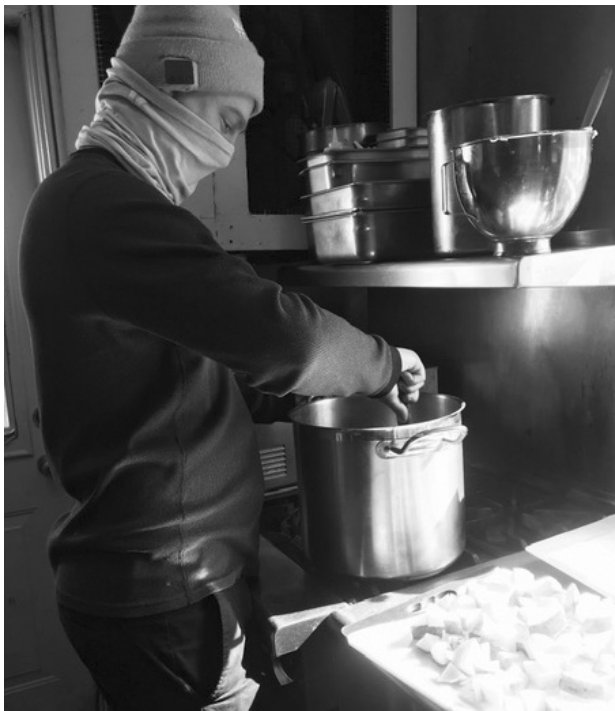
An Edd's Place staff member prepares an item for the Thanksgiving meals distributed by the Rotary Club with support from the Westbrook Foundation.

The Westbrook Foundation provided $1,680 in grant funding for the Old Saybrook Rotary Club's initiative to distribute 50 take-home meals to Westbrook seniors.