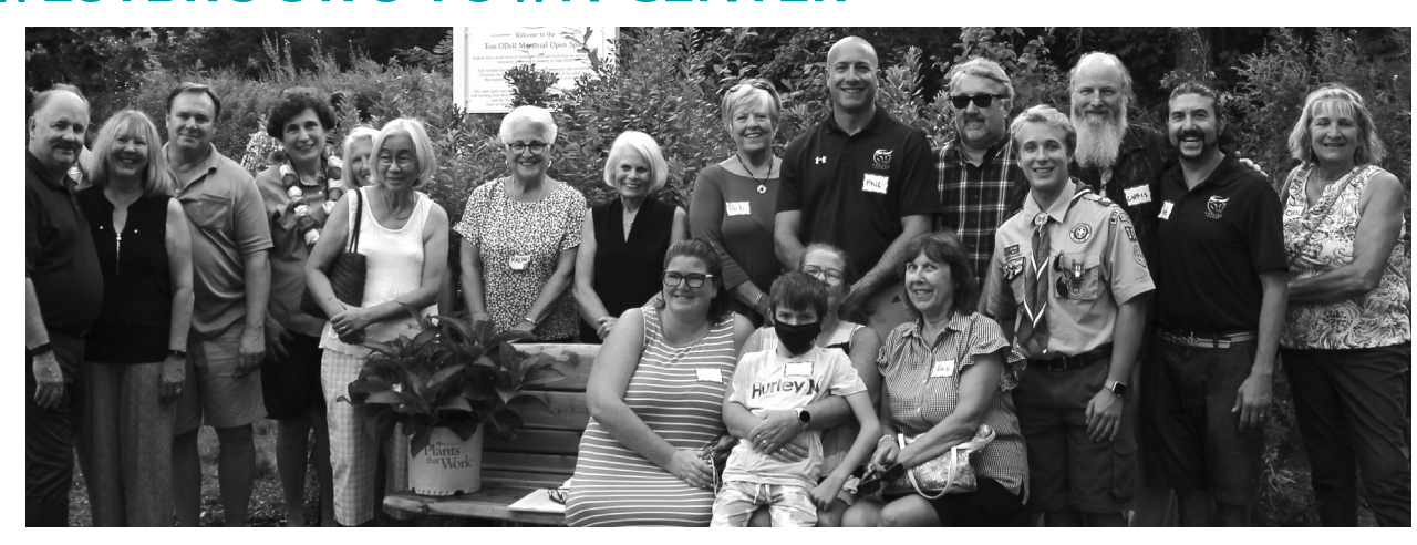
Members of the Westbrook Foundation and the Westbrook Garden Club celebrate the opening of the Meadow Walk in the Tom ODell Memorial Open Space area on September 15, 2021.

The Foundation's early support of the project was "a catalyst for other financial and in-kind community support for the project," WGC said at the time,